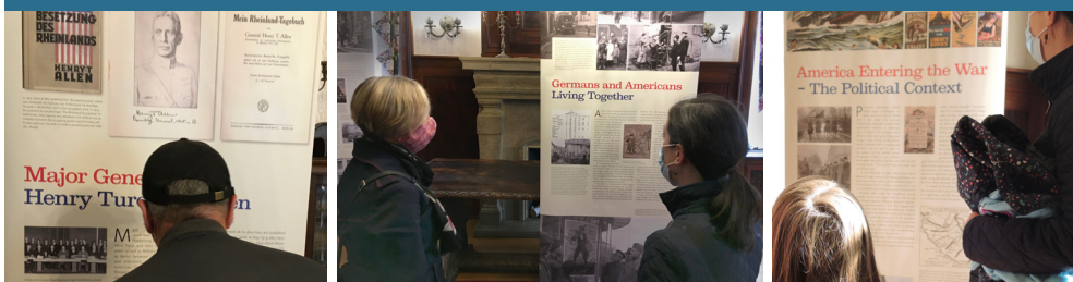
Visitors viewing the Stars and Stripes Over the Rhine exhibit at the GAI.

The Transatlantic Chapters series continues with virtual and in-person events that explore new topics in German-American history.